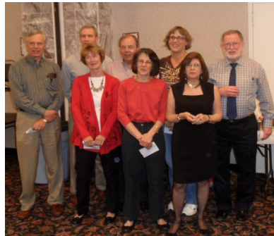
NVBA Mini-McKenney winners 2013: